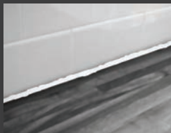
Apply bead of caulk