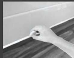
Select the curve and bead size you desire. Place that tip of the smoothing tool against the caulk bead and begin to tool it. Use one smooth motion for best results. Wipe away excess as needed.