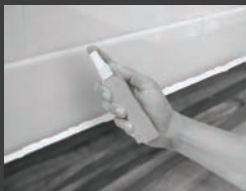
Mist the caulk bead and smoothing tool with SSK smoothing spray